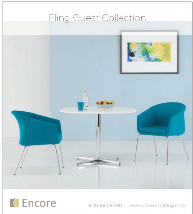
Select No. 180 at ContractDesign.com/readerservice