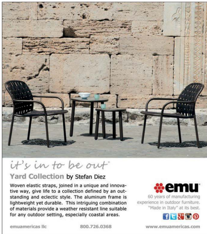
Select No. 16 at ContractDesign.com/readerservice